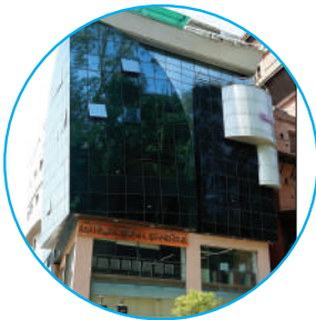
CORPORATE OFFICE BUILDING