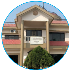
KOSHI PROVINCE OFFICE BUILDING